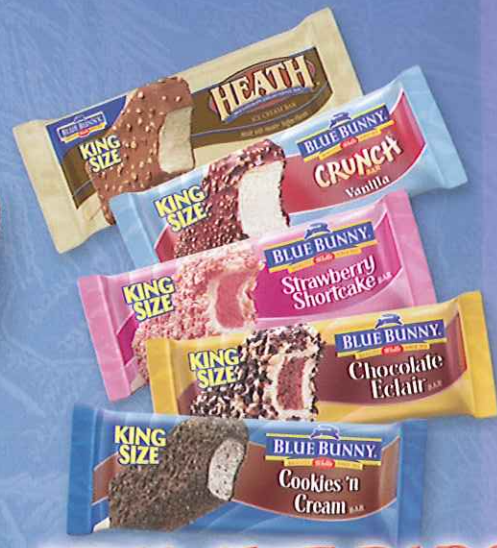
KING SIZE BARS