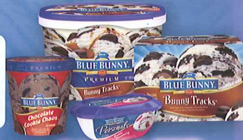
PACKAGED ICE CREAM

Distributed by New England Ice Cream 1-800-762-1552