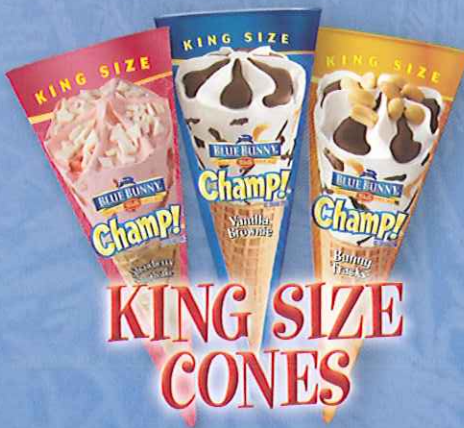
KING SIZE CONES